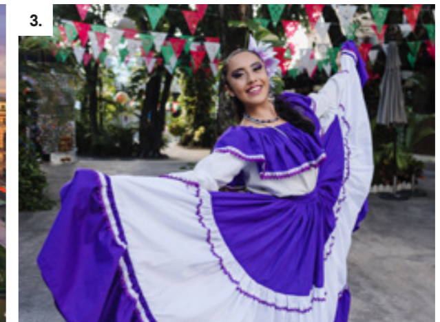
1. Puebla 2. Palacio de Bellas Artes, Palace of Fine Arts, Mexico City 3. Women in traditional dress