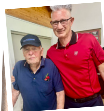
ANZAC Day was commemorated across all homes, including Kapara.