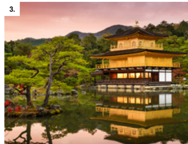
1. Mount Fuji 2. Senso-Ji Temple, Tokyo 3. Golden Pavilion, Kyoto