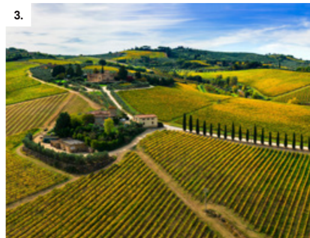
1. Grand Canal, Venice 2. Pisa 3. Tuscany