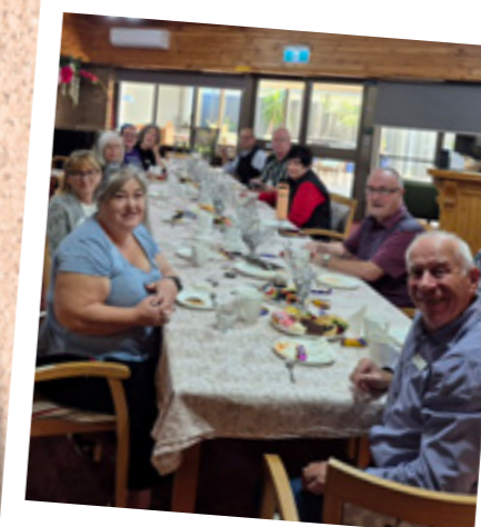
Volunteers at Perry Park attended a National Volunteer Week morning tea.