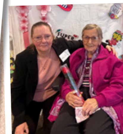
Mother's Day high tea at ViTA was a delightful celebration of mums and remarkable women.