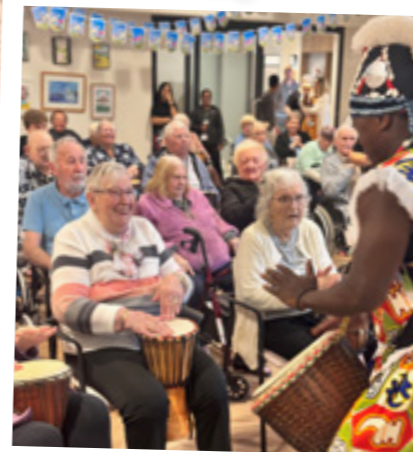
The Sun of Africa drummers had residents stomping and clapping at Healthia.

Here's a snapshot of residents enjoying a variety of experiences in the past few months as part of ACH Group's social and wellbeing program.