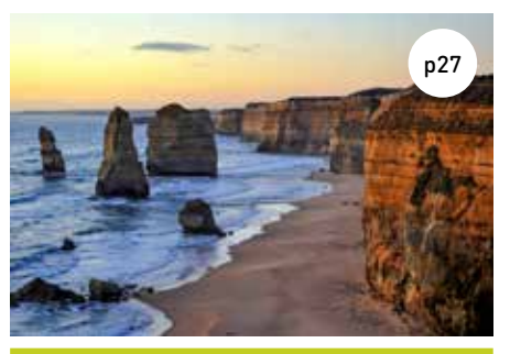
Great Ocean Road

Experience the Barossa Valley like never before with a line-up to treat your taste buds.