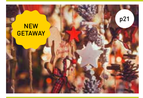
Hahndorf Christmas Getaway

Put your Santa hats on as we enjoy Lobethal Lights and Hahndorf's Christkindlmarkt.