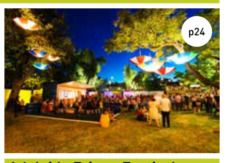
Adelaide Fringe Festival

Put your Santa hats on as we enjoy Lobethal Lights and Hahndorf's Christkindlmarkt.